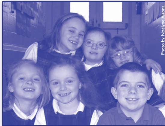
Children from St. John the Evangelist, Silver Spring